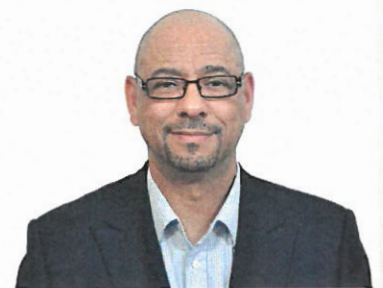
123 INSIGHT www.123insight.com Stand E17

Visitors to the booth can also take away a 123insight multimedia USB stick, filled with demonstration videos broken down by job role, allowing each department head to understand what 123insight can do for their departments as well as the business as a whole.